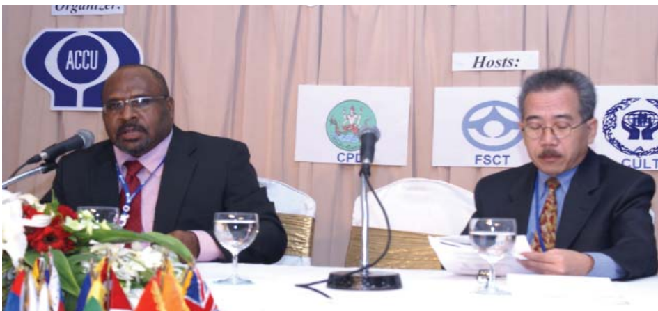
Mr. Benny Popoitai, Deputy Governor, Bank of Papua New Guinea and Mr. Untung Tri Basuki, Deputy Minister for Institutional Development, The State Ministry of Cooperatives and SMEs, Indonesia

Renowned as the world of ACCU acronyms for prudential standards (such as PEARLS-HIMAL, PEARLS-GOLD, PEARLS-RUPEES, GLARES, COOP-PESOS), ACCRA is added for the regulators to keep in mind. ACCRA (Asian Credit Union/Cooperative Regulators Alliance) was formed at the 4th Regulators Conference held in Bangkok on May 15-18, 2009.