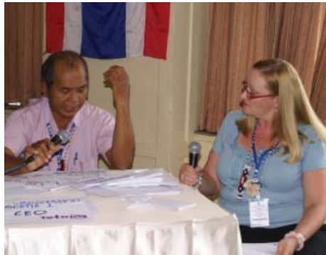
4 - 31 DEs Raise Passion on Credit Union Mission