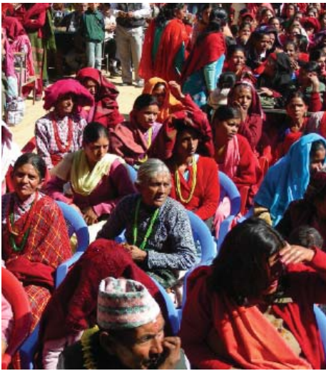
Annual General Meeting in Bhindavasini SACCO (Nepal): Cooperatives emerged to help poor households escape the debt trap and provide access to better quality goods and services.

Theme: “Driving Global Recovery through Cooperatives”