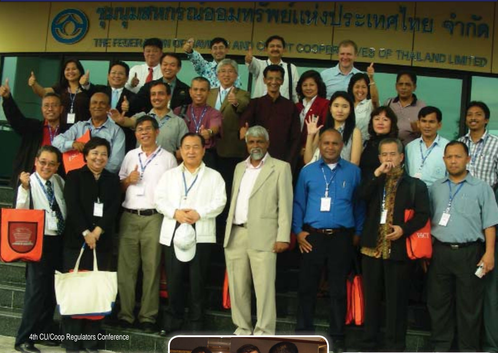
4th CU/Coop Regulators Conference