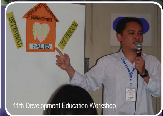
11th Development Education Workshop