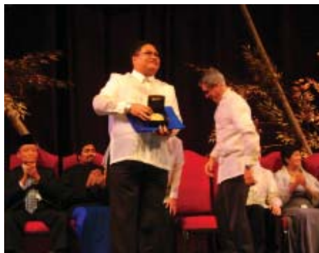
9 - Growing Cooperation: New Members -CARD & Tagum