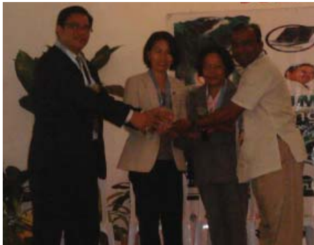
3 - OUTLOOK: Making a Life Better for the Poor?

The Association of Asian Confederation of Credit Unions operates as a regional representative organization of credit unions and similar cooperative financial institutions in the region of Asia. ACCU is representing 45 million individual members from 54,133 credit unions in 20 countries in Asia. ACCU works in partnership with its member organizations [apex body of credit unions] to promote and strengthen credit unions as vehicles of community development and socioeconomic development of people.