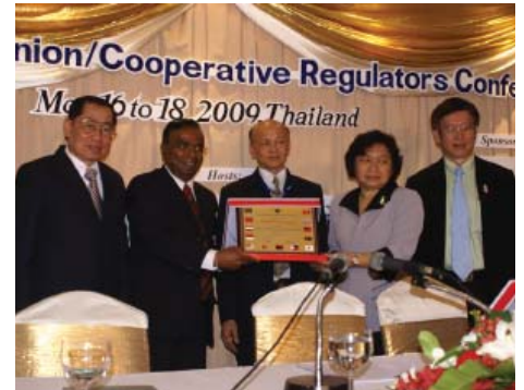
6 - ACCRA Formed at the 4th CU/Coop Regulators Conf.