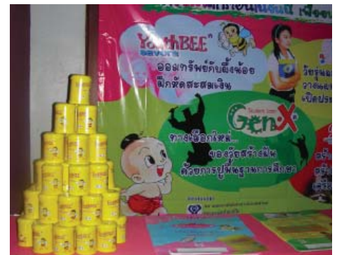
9 - CUs to Intensify Social & Financial Literacy